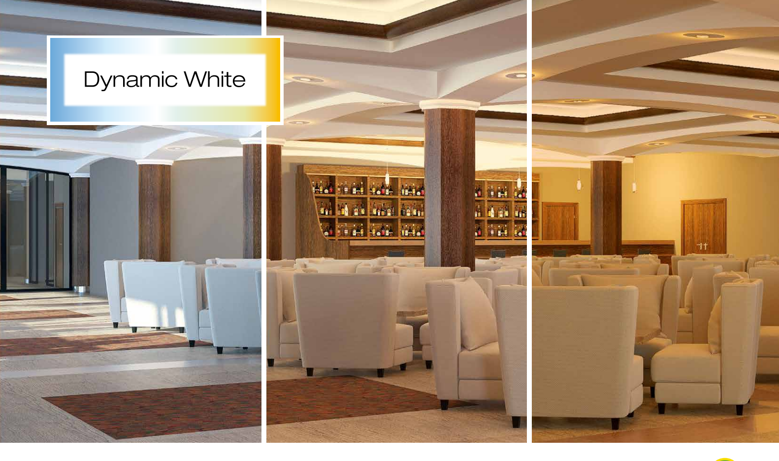
A genuinely brilliant idea