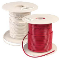
18 -20 AWG wire