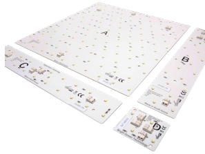
Bright Green Grid 30