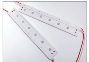
Bright Green Duo