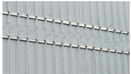
Lumen Maintenance Examples

We expected the LED system to achieve an L70 of 50,000 hours, that's 5.5 years of 24/7 operation. When our engineering team removed the LEDs to test the performance - the measured brightness was found to be just 20%, not 30%, reduced and they were in near perfect condition.