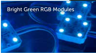
Bright Green RGB Modules